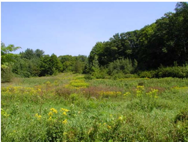
Old-field component at Whipple Hollow WMA.