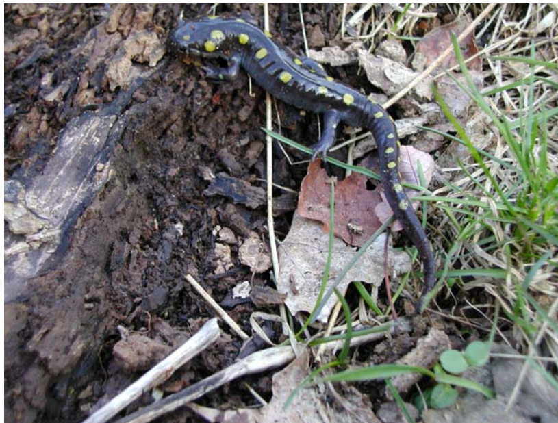
Spotted salamanders live mostly underground and are seldom seen except during their annual trek to ponds to breed.

Fish Old Marsh Pond is a warmwater fishery and supports brown bullhead, yellow perch, pumpkinseed, northern pike, bridle shiner and chain pickerel.