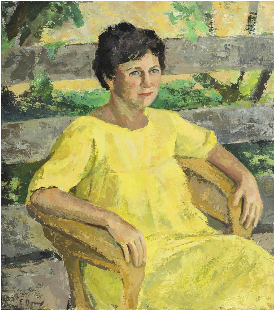
Elsie Dorey Upham (American, b. 1907). Olga Hirshhorn , 1979. Acrylic on canvas. 35 1/4 x 31 1/2 inches. Artis—Naples, The Baker Museum. Bequest of Olga Hirshhorn. © Elsie Dorey Upham.