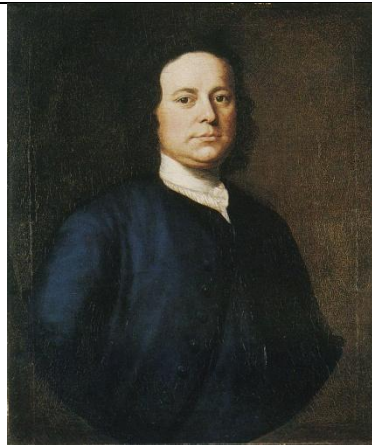
Gershom Flagg (1705 – 1771)