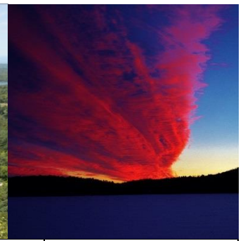
Sunset at Beebe Pond