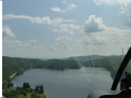
Beebe Pond from Helicopter