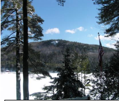
Eagle Rock across the lake from us