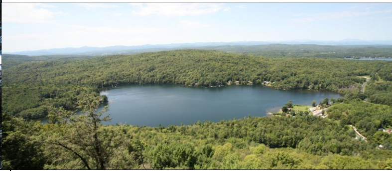
Our house is west of Eagle Rock in the center. Adirondacks in the west.