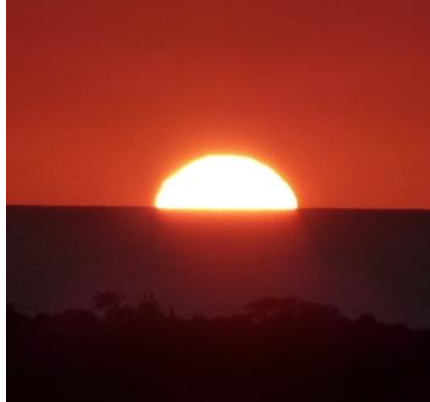
Sunset on the Gulf in Naples, FL