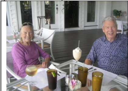
Pina Colada: Rod & Gun Cub in October