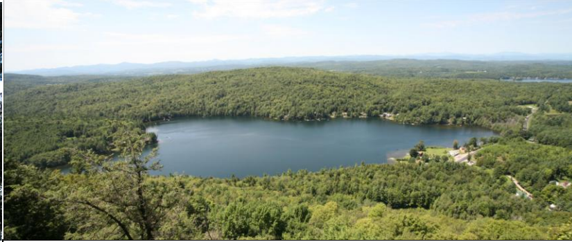
Our house is west of Eagle Rock in the center. Adirondacks in the west.