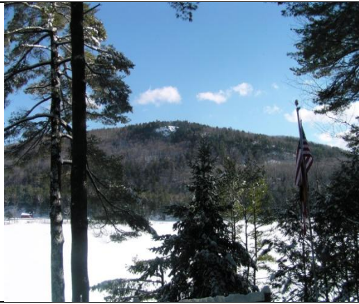
Eagle Rock is across the lake from our house