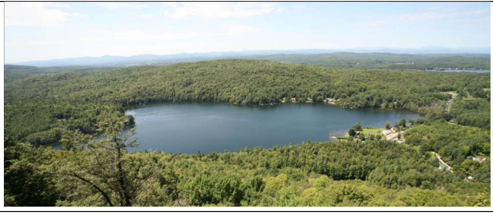
Our house is west of Eagle Rock in the center. Adirondacks Mountains are in the background