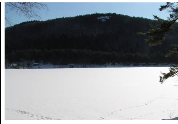
Eagle Rock and Lake Beebe